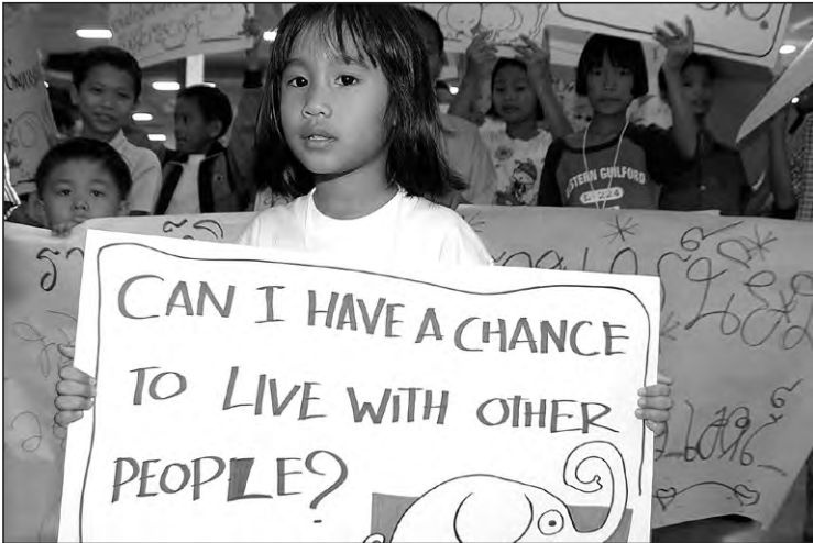
Orphaned youths who have lost their parents to AIDS hold placards at the XV International AIDS conference in Bangkok, Thailand, on July 13. Jesuit Father Michael Czerny, coordinator of the African Jesuit AIDS Network in Nairobi, Kenya, said poverty was a "cause and consequence" of the disease. Father Michael credited Churches in Africa for responding to the challenge of AIDS.