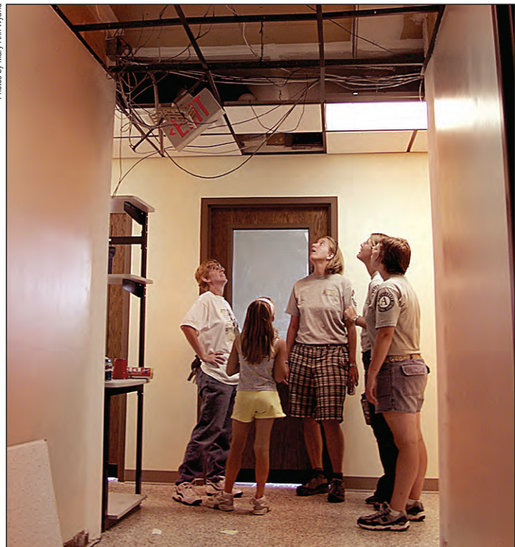
Above, St. Elizabeth's Pregnancy and Adoption Services' administrative offices and housing for teenage girls facing unexpected pregnancies remain closed after a May 30 tornado caused significant damage.