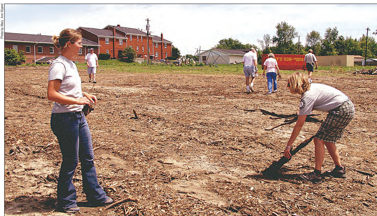
Volunteers from area parishes and service members of the Americorps National Civilian Community Corps help clean up some of the remaining debris from the Memorial Day weekend tornado on July 24 on the grounds of St. Elizabeth's Pregnancy and Adoption Services in Indianapolis. The tornado seriously damaged St. Elizabeth's administrative offices and residential building and felled about 300 trees on the nine-acre property.