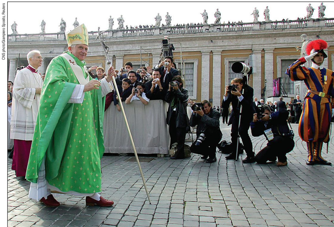
Pope Benedict XVI waves to the faithful as he arrives for the canonization ceremony of Italian Sister Rosa Venerini, Mexican Bishop Rafael Guizar Valencia, Italian Father Filippo Smaldone and Mother Theodore Guérin, foundress of the Sisters of Providence of Saint Mary-of-the-Woods, at St. Peter's Square at the Vatican on Oct. 15.