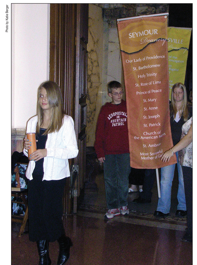
Deanery representatives from the archdiocese's 11 deaneries process in with candles and banners at the beginning of the Oct. 15 Mass for youths at the Church of the Immaculate Conception at Saint Mary-of-the-Woods. About 300 young people attended the Mass honoring St. Theodora Guérin.