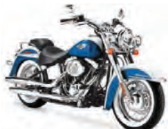
2007 Harley Davidson Sportail Deluxe Provided by:

Don't miss your opportunity to bid on this Trojan Blue 2003 Chrysler PT Cruiser and this 2007 Harley Davidson Sportail Deluxe , along with many other exciting auction items, at Chatard-A-Bratation 2007!