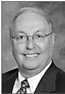
Sen. Tom Wyss