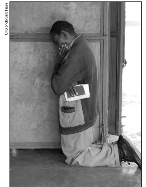
A Kenyan man prays after receiving Communion. Vatican-released statistics show the Church in Africa grew by 3.1 percent in 2005.

For every 100 seminarians in the world at the end of 2005, 32 were from the Americas, 26 were Asian, 21 African, 20 European and one from Oceania, the Vatican said. †