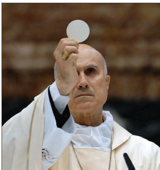
Italian Cardinal Tarcisio Bertone, Vatican secretary of state, celebrates Mass for military bishops at St. Peter's Basilica at the Vatican last October.

The media has warmed to the cardinal's personality and given him ample ink