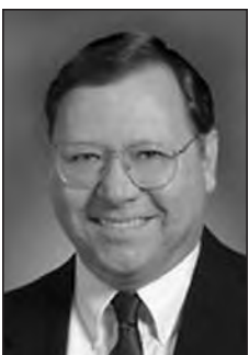
Sen. Joe Zaka