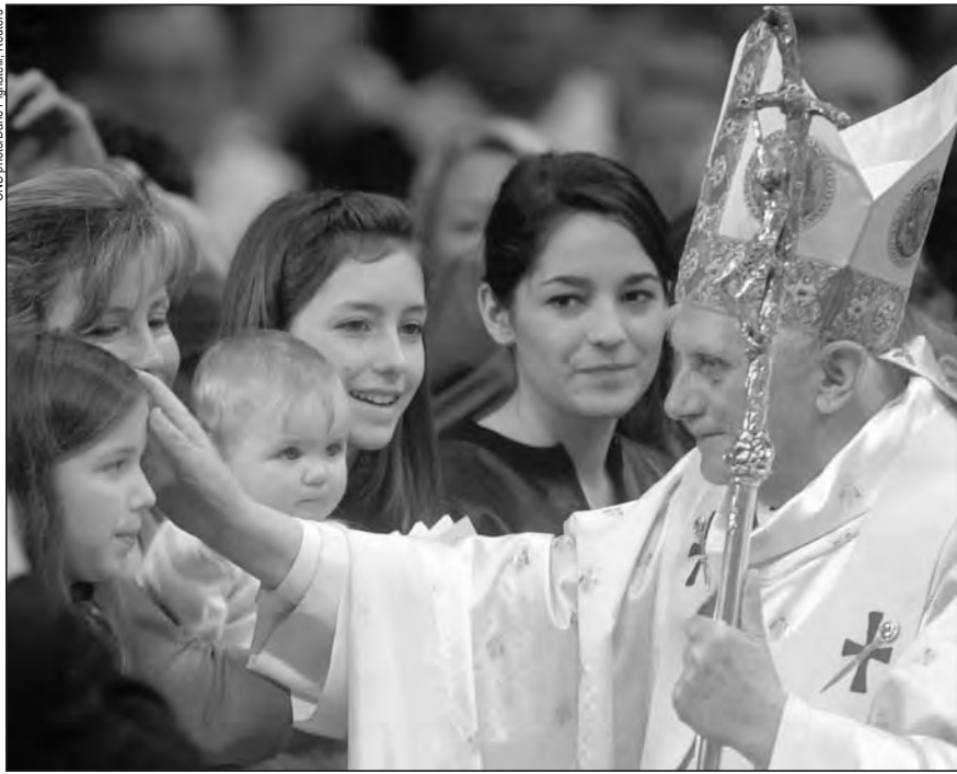
Pope Benedict XVI blesses young pilgrims at the end of Mass on St. Peter's Basilica on Jan. 1. The pontiff marked World Peace Day by quoting from his peace day message in his homily. He said every Christian has a special duty as a peacemaker.