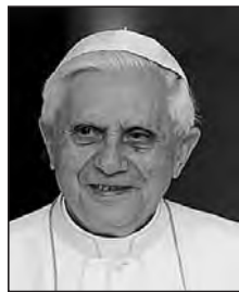
Pope Benedict XVI

VATICAN CITY (CNS)—A bishop can turn to Catholic lay movements not only