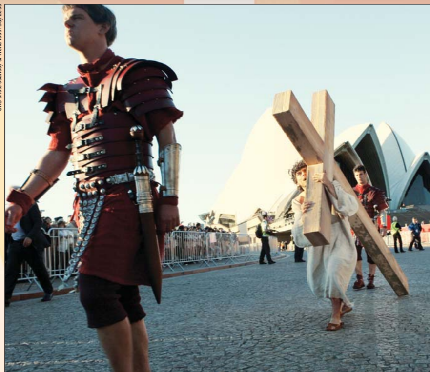
CNS photo/Anthony of World Youth Day 2008