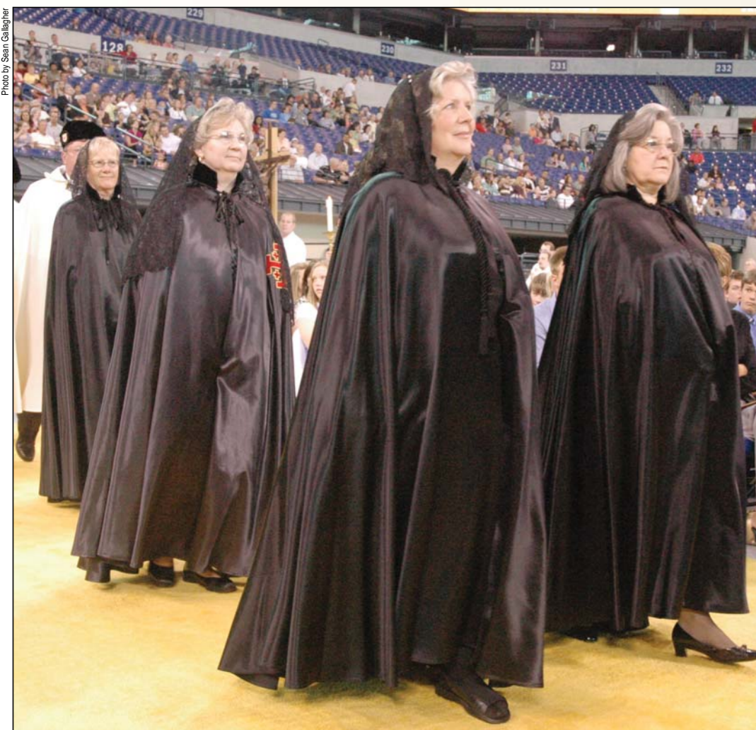
Members of the Equestrian Order of the Holy Sepulchre of Jerusalem walk in the opening procession. The order works to preserve Catholic sanctuaries and the presence of the Church in the Holy Land.