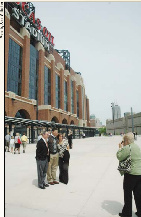
Mass-goers get their photo taken outside Lucas Oil Stadium before the Mass.