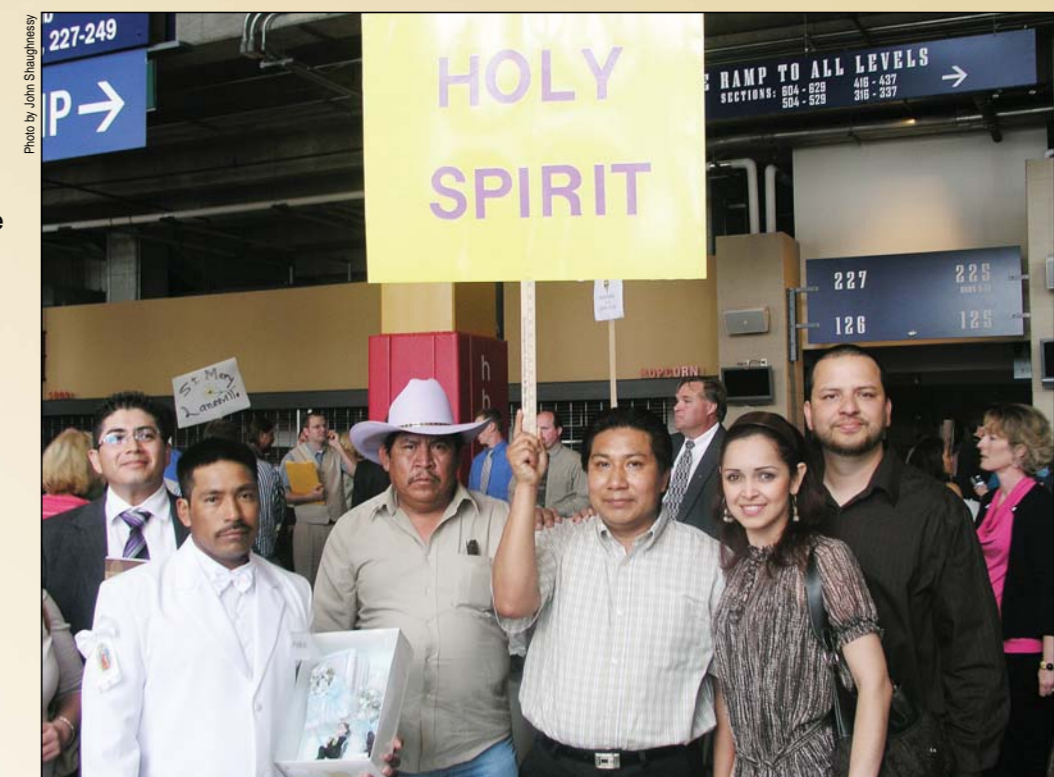
Members of Holy Spirit Parish in Indianapolis gather inside Lucas Oil Stadium in Indianapolis on May 3 before the 175th anniversary Mass.