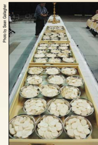
Dozens of patens filled with Communion hosts sit on a table near the altar during the Mass. Communion was later distributed throughout the stadium.