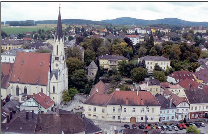
This view of the scenic village of Melk, Austria, was taken from the historic Melk Abbey on Sept. 28.