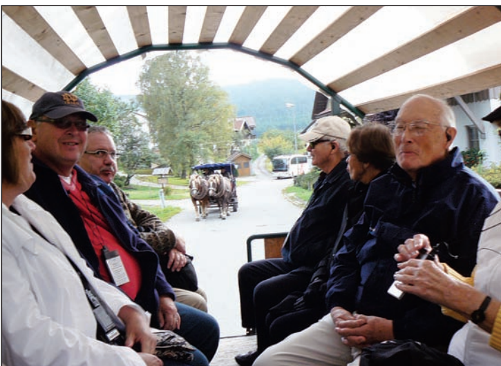
Archdiocesan pilgrims begin a horse-drawn carriage ride on Sept. 30, which took them through a beautiful forest in Bavaria in southern Germany.