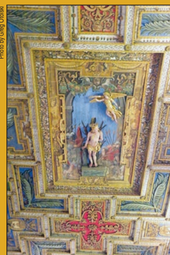
After touring the Catacombs of St. Sebastian, archdiocesan pilgrims spent time in the Basilica of St. Sebastian, which is built over the catacombs and is renowned for its carved ceiling depicting St. Sebastian's martyrdom.