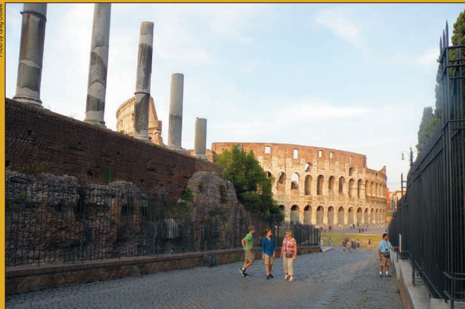
One of the most photographed sites in Rome is the Colosseum, which was begun by the Emperor Vespasian in 72 A.D. On Good Friday night, the pope leads the Stations of the Cross and a prayer vigil at the ancient stadium.