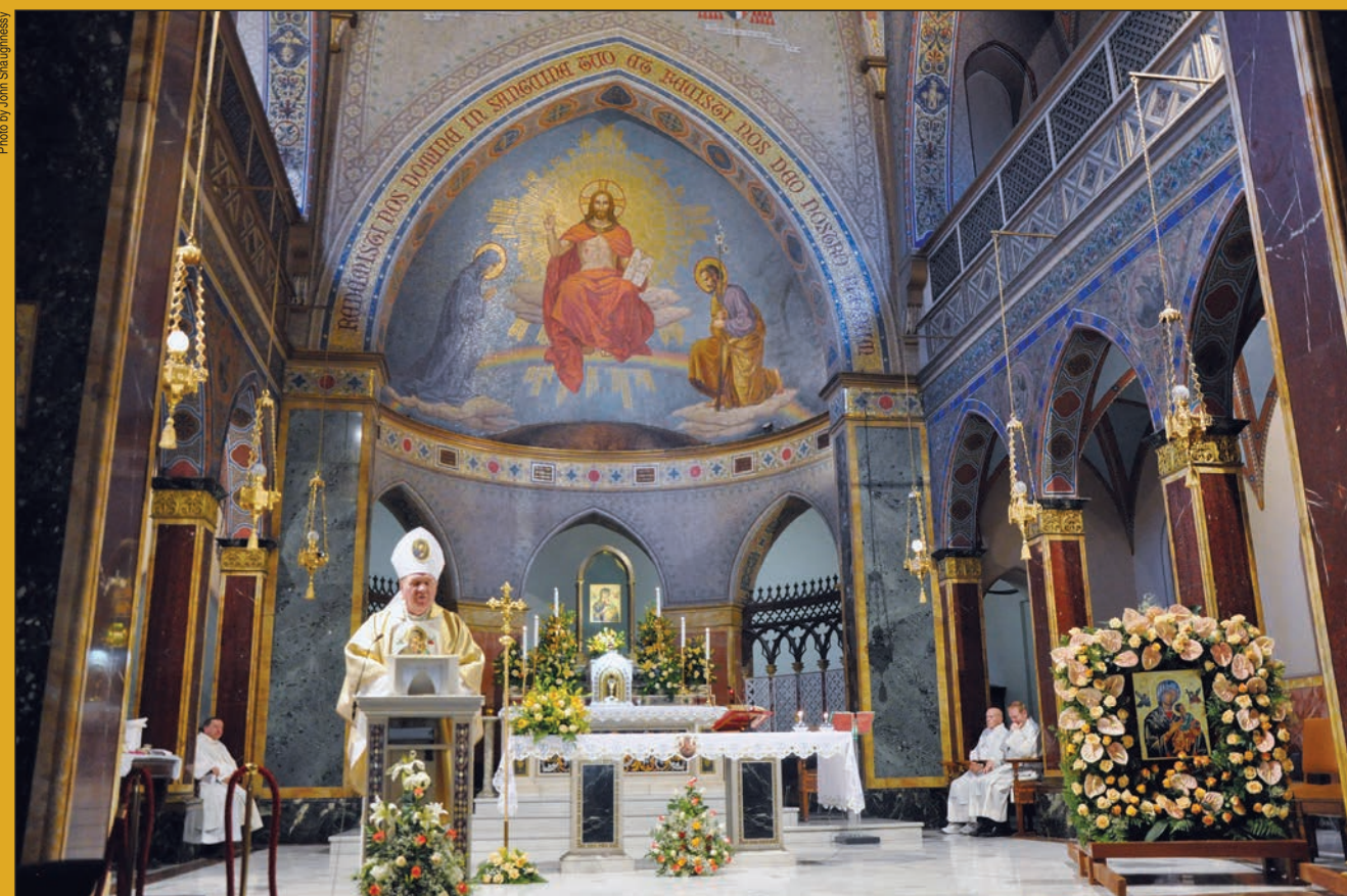
Returning to the Church of St. Alphonsus Liguori in Rome—the church dedicated to the founder of the Redemptorist order which Archbishop Joseph W. Tobin previously led as its superior general—to celebrate Mass for the archdiocesan pilgrims on July 1 was an emotional homecoming for the archbishop, who had lived in his order's community in Rome for 18 years.