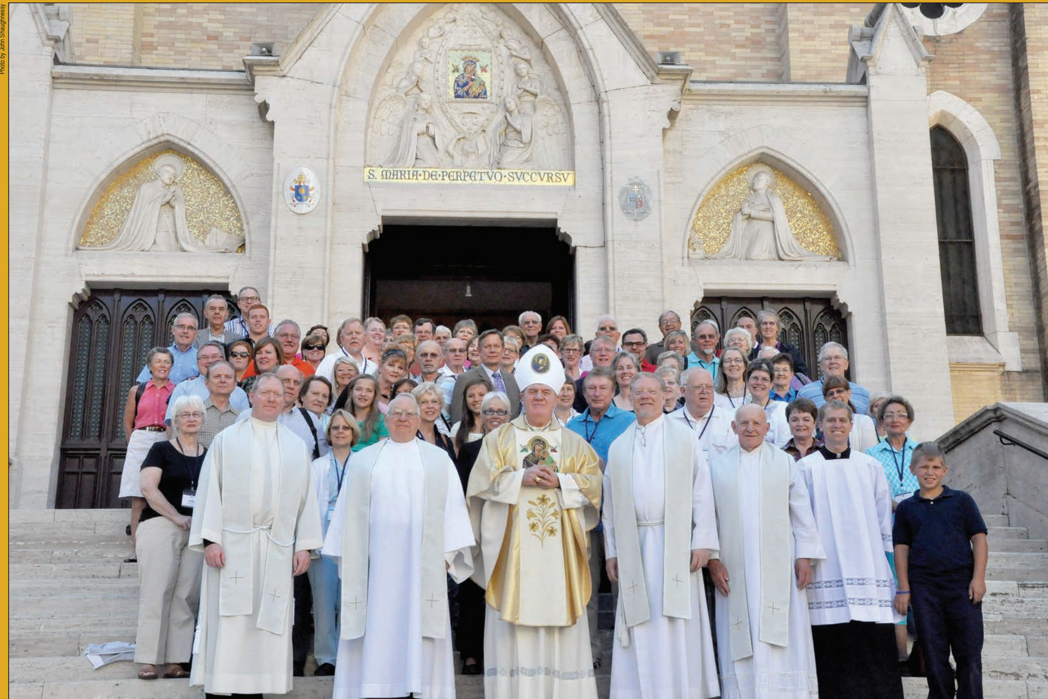
Pilgrims on the archdiocesan pilgrimage to Italy pose for a group photo on the steps of the Church of St. Alphonsus Liguori—the founder of the Redemptorist religious order which Archbishop Joseph W. Tobin previously led as its superior general—following the pilgrims' farewell Mass in Rome on July 1.