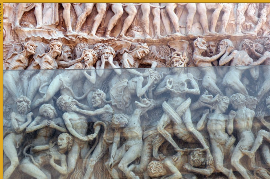
The Gothic façade of the Cathedral of Orvieto is considered one of the great masterpieces of the Late Middle Ages. Stories from the Bible are intricately sculpted into the face of the 14th-century cathedral.