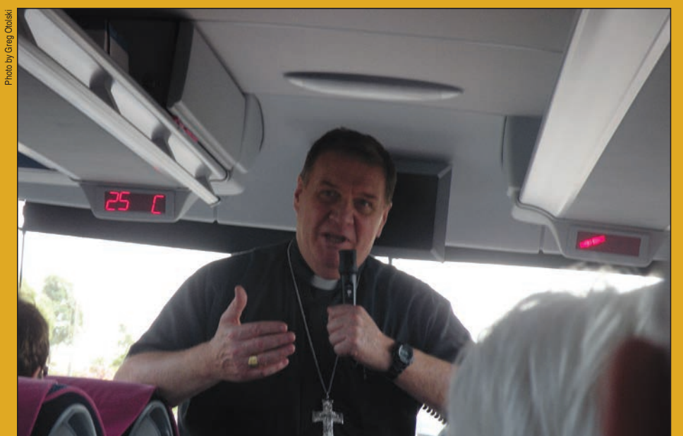
During the archdiocesan pilgrimage in Italy, Archbishop Joseph W. Tobin occasionally used the tour bus microphone to share stories and details about the country where he lived for 21 years while serving the Church.