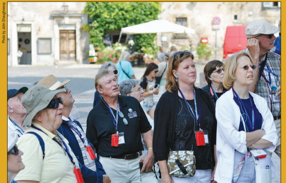
Archdiocesan pilgrims react in amazement on June 27 to the Cathedral of Orvieto, a breathtaking place of worship that took three centuries to complete in honor of the Miracle of the Eucharist that happened near that Italian town in 1263.