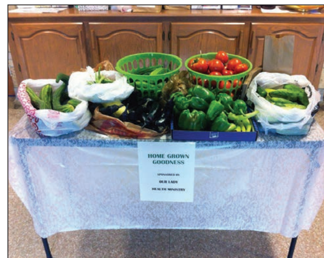
Home-grown vegetables are free for the taking as a part of Our Lady of Perpetual Help Parish's health ministry. The New Albany Deanery parish is one of many parishes throughout central and southern Indiana offering health ministry, which seeks to promote wellness of body, mind and soul for Catholics in the archdiocese.

Concepts like tapping into existing ministries and ideas like a prayer shawl ministry were shared at the archdiocesan Parish Nurse Retreat held on June 13 at St. Agnes Parish in Nashville. Such sharing provided inspiration and direction to many who attended the retreat with plans to start a health ministry in their parish. (See related article below.)