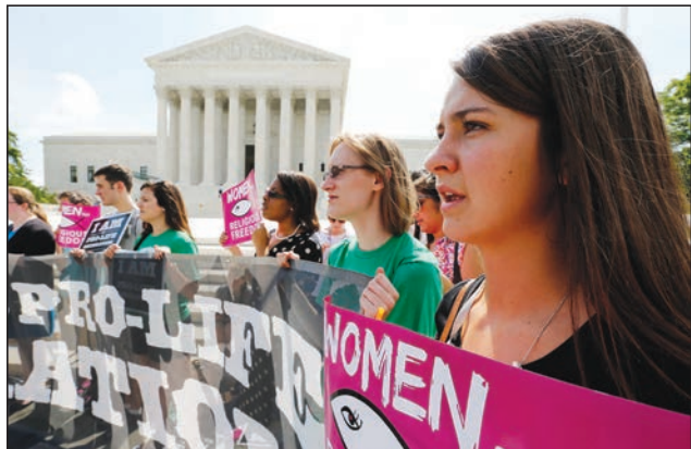
Pro-life demonstrators sing outside the U.S. Supreme Court in Washington on June 26 as they await the court’s ruling on a Massachusetts law that mandated a buffer zone to keep protesters away from abortion clinics. In a unanimous ruling, the court said the 2007 law violated the freedom of speech rights of pro-lifers under the First Amendment of the U.S. Constitution.

The decision, a victory for pro-life groups, reversed an appellate court decision upholding a 2007 Massachusetts law that made it a crime for anyone other than clinic