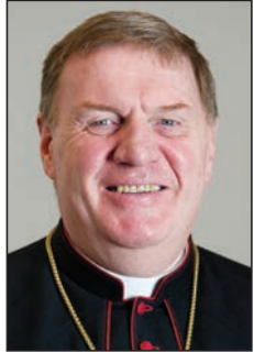
Archbishop Joseph W. Tobin

The Catholic bishops of the United States have asked us all to observe a two-week period of prayer, reflection and action, June 21–July 4, known as the “Fortnight for Freedom.” The timing turns out to be providential because in the midst of the Fortnight some important decisions affecting our state and our nation have been made by federal courts.