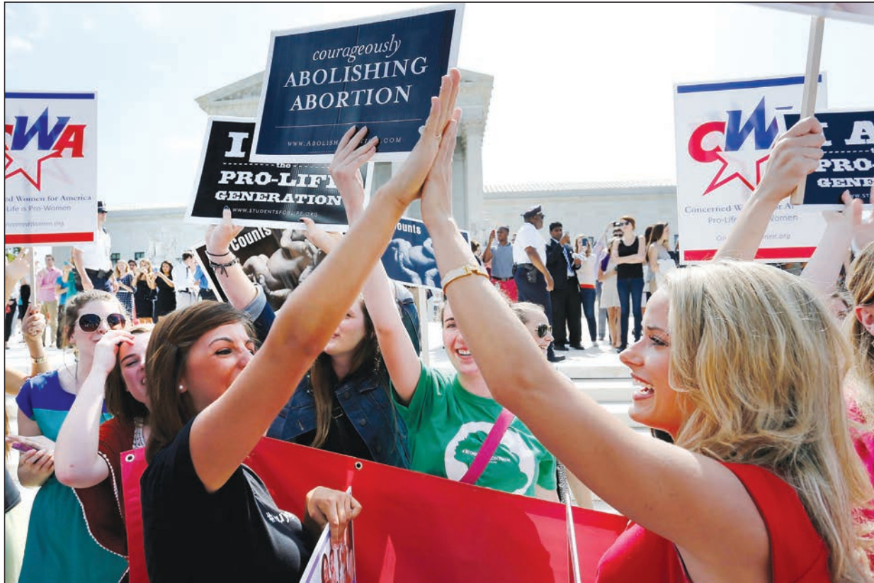
Pro-life demonstrators celebrate on June 30 outside the U.S. Supreme Court in Washington as its decision in the Hobby Lobby case is announced. The high court ruled that owners of closely held corporations can object on religious grounds to being forced by the government to provide coverage of contraceptives for their employees.