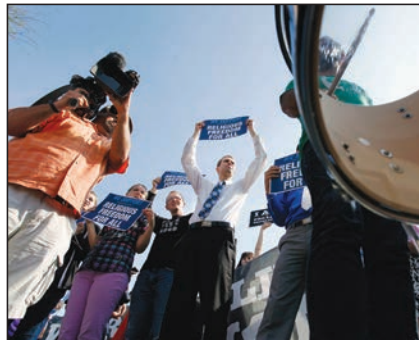
A drummer joins demonstrators outside the U.S. Supreme Court rallying against a federal mandate requiring most employers to cover contraceptives for employees as part of their health care. The court ruled owners of closely held corporations can object on religious grounds to providing birth control.

Similarly, the Church is not against the fundamental purpose of the Affordable Care Act (Obamacare). Catholics have long argued for accessible and affordable health care for everyone—consistent with the healing ministry of Jesus and the tradition of Catholic health care. But we cannot stand by idly when our government requires faith-based organizations like the Little Sisters of the Poor, or family businesses like Hobby Lobby, to provide employees with drugs and services that violate their religious beliefs. The cherished tradition of religious freedom in this country argues forcefully against the imposition of secular values on people of conscience who genuinely oppose practices that truly are countercultural because they denigrate both the