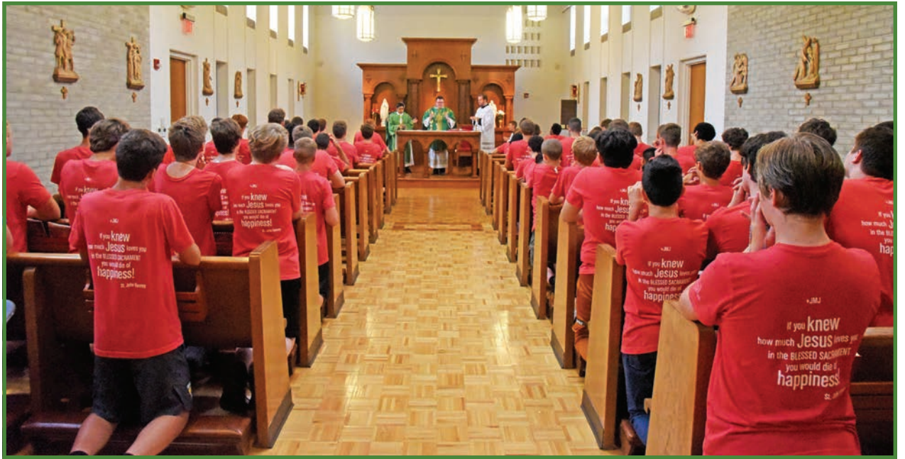
Nearly 100 teenage boys from across and beyond the archdiocese kneel in prayer on July 7 during a Mass in the chapel of Bishop Simon Bruté College Seminary in Indianapolis. The teenagers were taking part in Bishop Bruté Days, an annual vocations camp sponsored by the archdiocesan vocations office.

(For more information on Bishop Simon Bruté College Seminary in Indianapolis, visit www.bishopbrute.org .) †