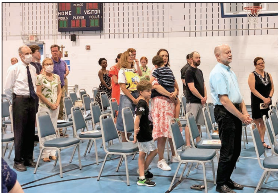
Catholics worship at Mass in the school gym next to St. Jane Frances de Chantal Church in Bethesda, Md., on July 10. Masses were shifted there after several fires were extinguished in the church earlier that day.

Also on July 10, in the Archdiocese of Kansas City,