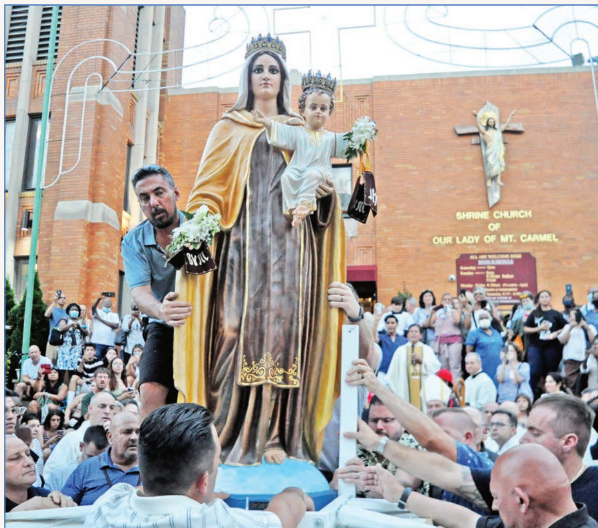
People are seen during the opening procession of the 135th annual feast honoring Our Lady of Mount Carmel and St. Paulinus at the Shrine Church of Our Lady of Mount Carmel in the Williamsburg section of Brooklyn, N.Y., on July 6.