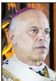
Archbishop Salvatore J. Cordileone

"May the light of God's compassion shine on us and guide our feet out of darkness and the shadow of death, and into the way of peace." †