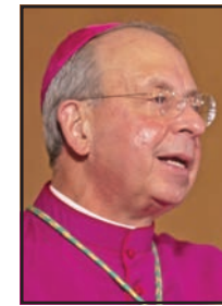
Archbishop William E. Lori

WASHINGTON (CNS)—The U.S. bishops' pro-life chairman said it is "deeply disturbing and tragic" that President Joe Biden has chosen to use his power as