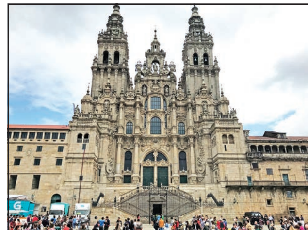
Pilgrims congregate in front of the historic shrine of St. James in Santiago de Compostela in Spain.

"Every hurt, ache or blister—sometimes every step—I would be reminded not to complain or whine, but instead to offer it up for those who had been through worse," he reflected. "I included them in my prayers, in our Mass prayers."