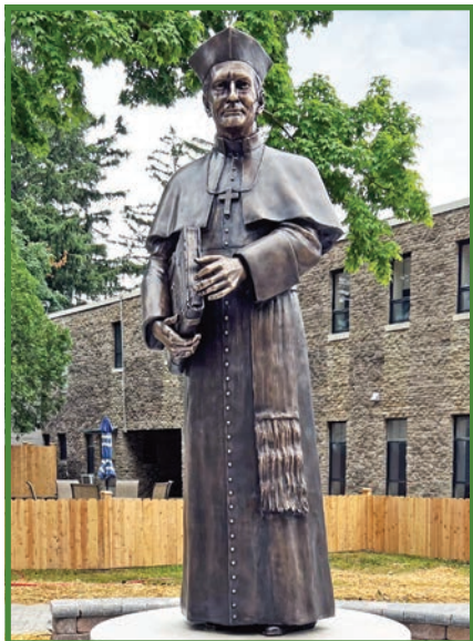
A newly created bronze statue of the Servant of God Bishop Simon Bruté is featured at the recently renovated back entrance of Bishop Simon Bruté College Seminary in Indianapolis.

The priest said Bishop Bruté "gave himself to a noble purpose" when he