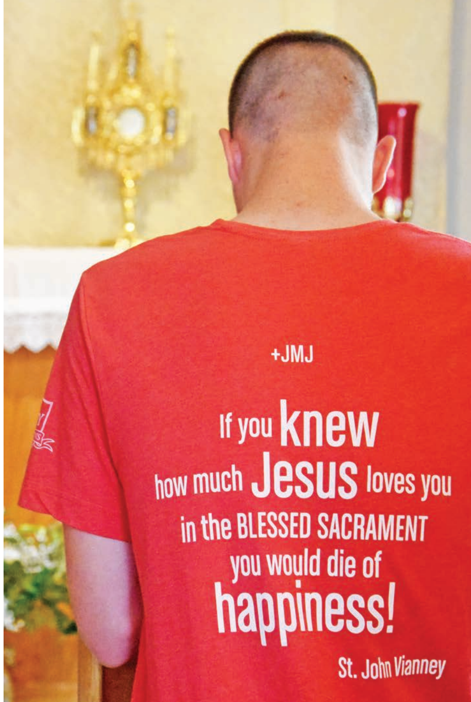
A Bishop Bruté Days participant kneels in prayer on July 6 in the Divine Mercy Perpetual Adoration Chapel at St. Joseph Parish in Shelbyville. The annual archdiocesan-sponsored vocations camp drew 90 teenage boys from across central and southern Indiana